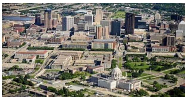
St. Paul and Minnesota Capitol