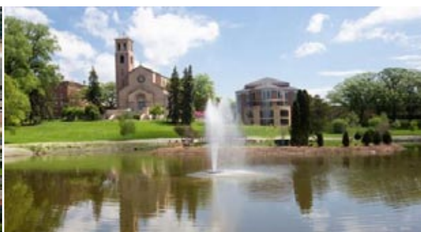
St. Catherine University