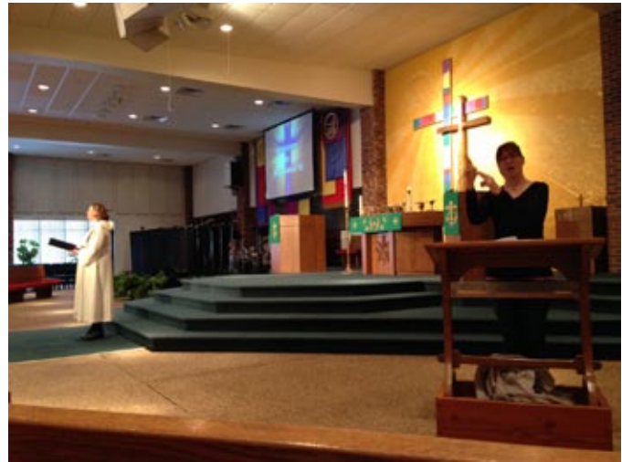
ASL interpreting during church service at Our Savior's Lutheran, Faribault, MN. CTHM has its office in the church.