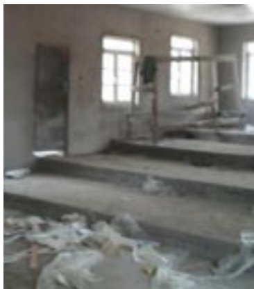
New pictures from Rev Ruth Ulea on their new church building in Nigeria. It looks Great!!