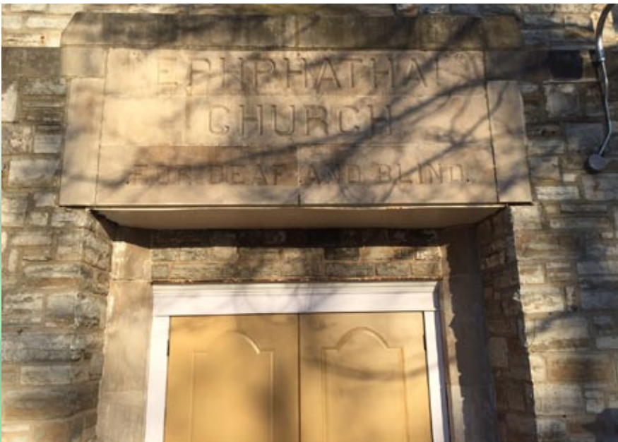
North side of the old Ephaphatha Church for the Deaf and Blind. It is now a church for the Hispanic Community in the Faribault area.