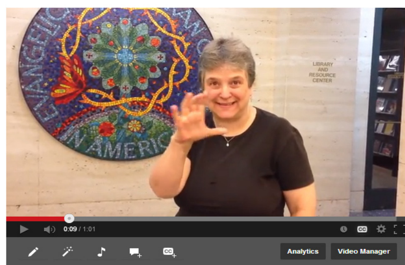
The link for Pastor Beth's message http://www.youtube.com/watch?v=4XoN85EQuUs