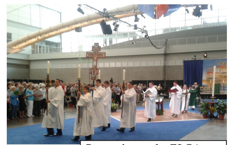
Procession at the ELCA Churchwide Worship

http:// ih.constantcontact.com/ fs177/1102701453684/