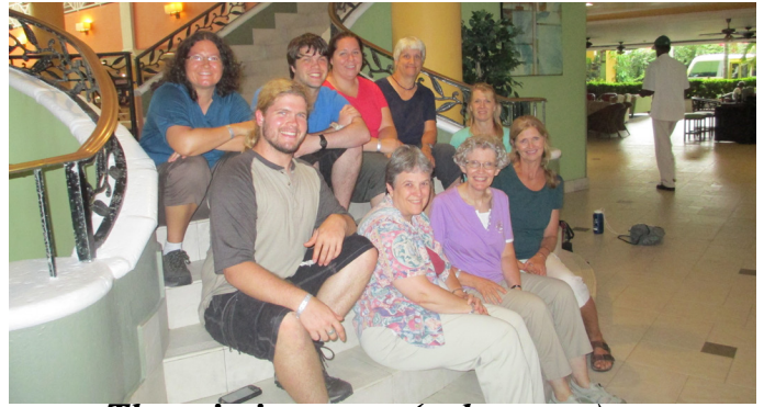
The mission team (volunteers)

Mill Neck team left on Tuesday but they were impressed with our work and the Board just voted this month to build a library and computer room on campus. JCSD Board voted to accept their