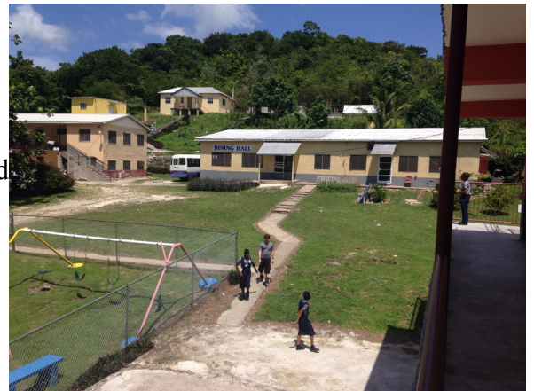
The campus of Jamaica Christian School for the Deaf