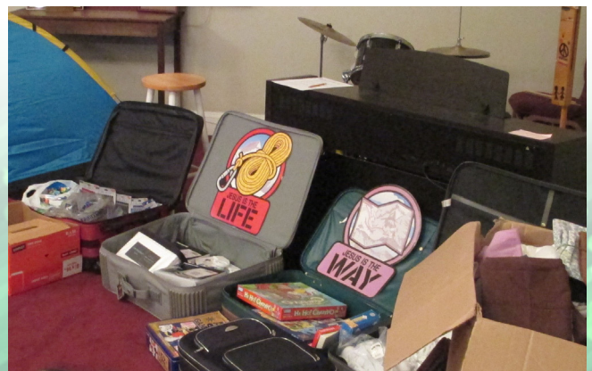
Many people donated school supplies for Jamaica Christian School for the Deaf