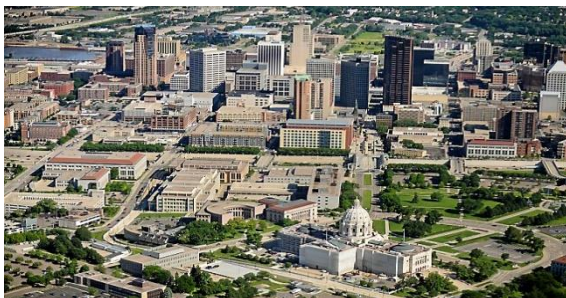
St. Paul and Minnesota Capitol