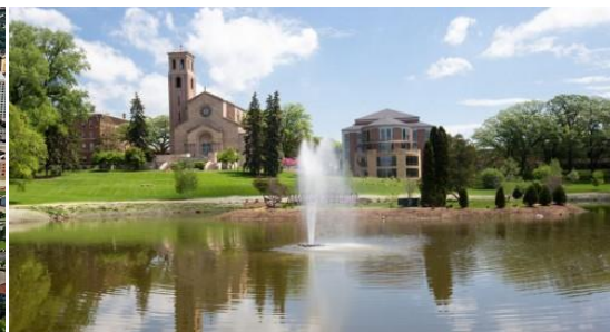
St. Catherine University