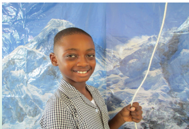
Deaf Students at the school

The first thing that happened at the Philadelphia Airport was that our plane developed engine trouble and the flight was canceled! We all had to get off the plane but staff and a couple team members with phones got us re-routed. The good thing was that we now had a DIRECT FLIGHT to Jamaica! The bad thing was that the luggage all went to North Carolina except