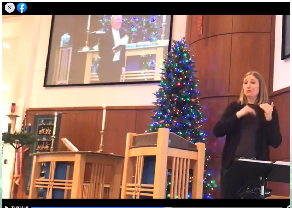
Interpreted Worship at Peace Lutheran Church in Sioux Falls, SD by Heartland Ephphatha Ministries