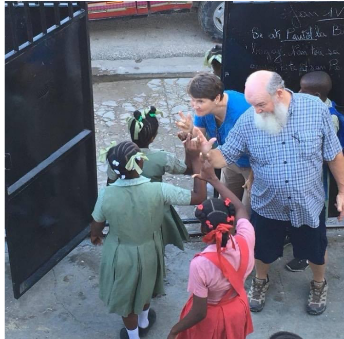
Welcoming back the students with a meal.