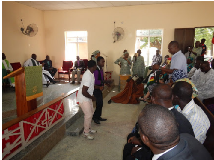
Special Dance Presentation by two of the church members. They had their own videographer. I did not get a photo of the church choir I only shot video.