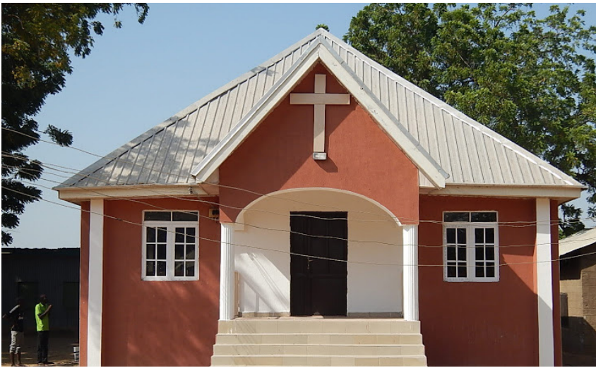
Front of Church Friday before dedication

These are pictures from the dedication of the church for the Deaf in Nigeria on November 13, 2016.