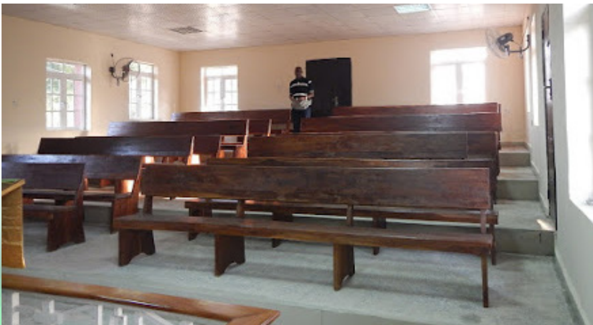
There are four levels and two rows of benches on each level.

From main entrance to the pulpit Friday before the dedication. The fans on the front wall were not planned. They were suppose to be on the back wall.