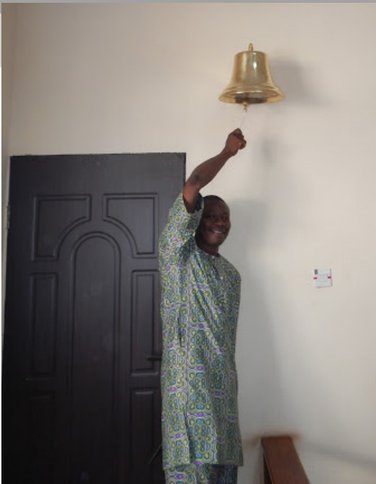
Ringling the bell to start the service. This is an exact replica of the bell at the Lutheran Deaf Church in Copenhagen Denmark. It is rung three times at the start of a service. In the name of the Father, Son and Holy Spirit.