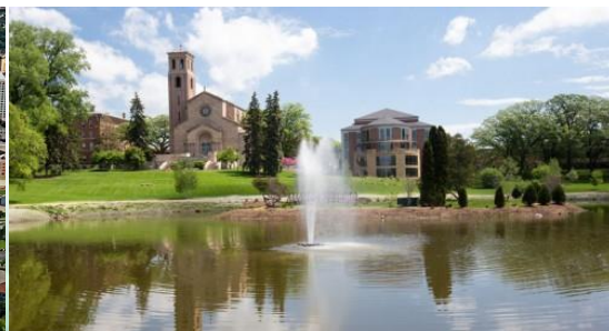
St. Catherine University