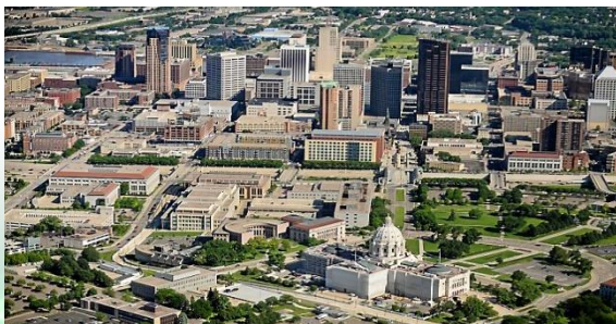
St. Paul and Minnesota Capitol