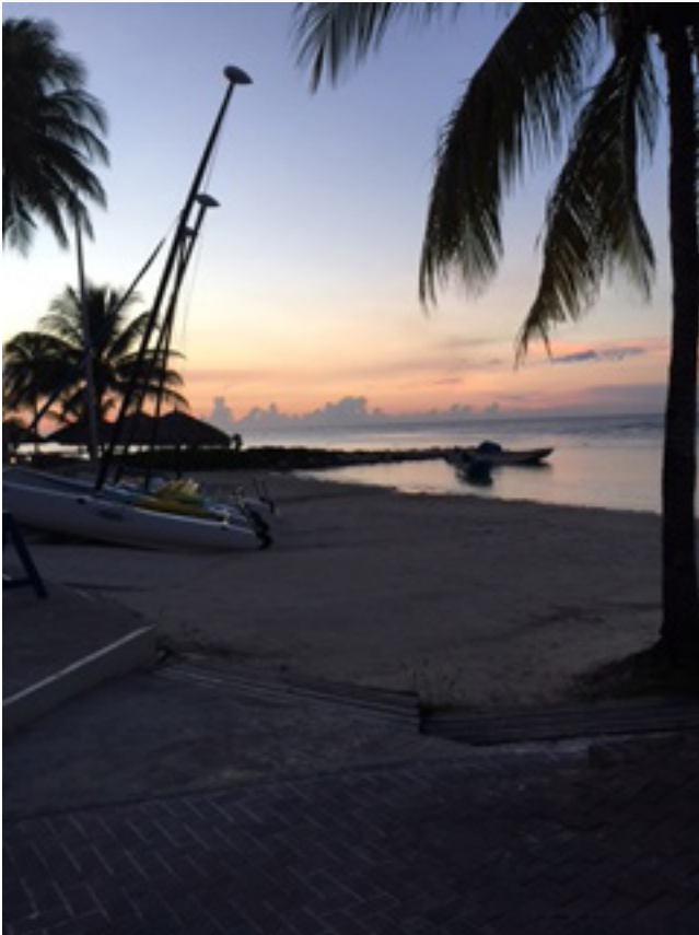
A sunset at the hotel.