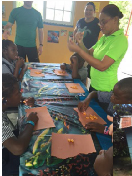
Our VBS craft class