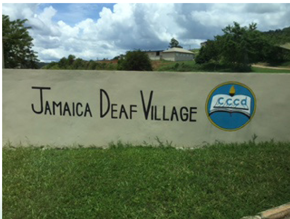
The entrance for Jamaica Deaf Village