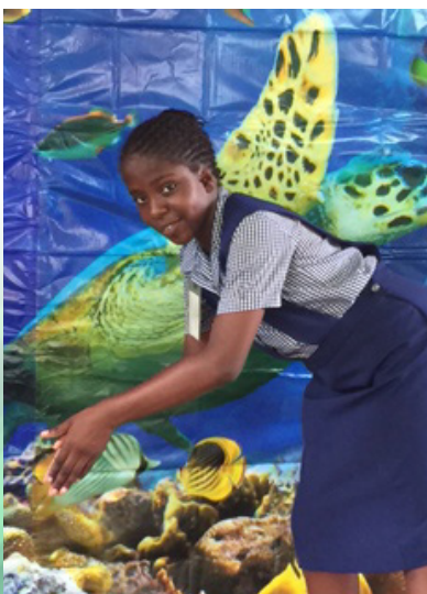
JCSD student in front of our ocean scene