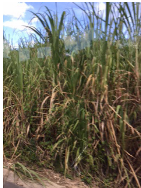
Sugar cane growing along the side of the road