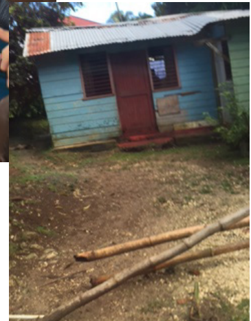
One of the impoverished homes in the mountains of Jamaica