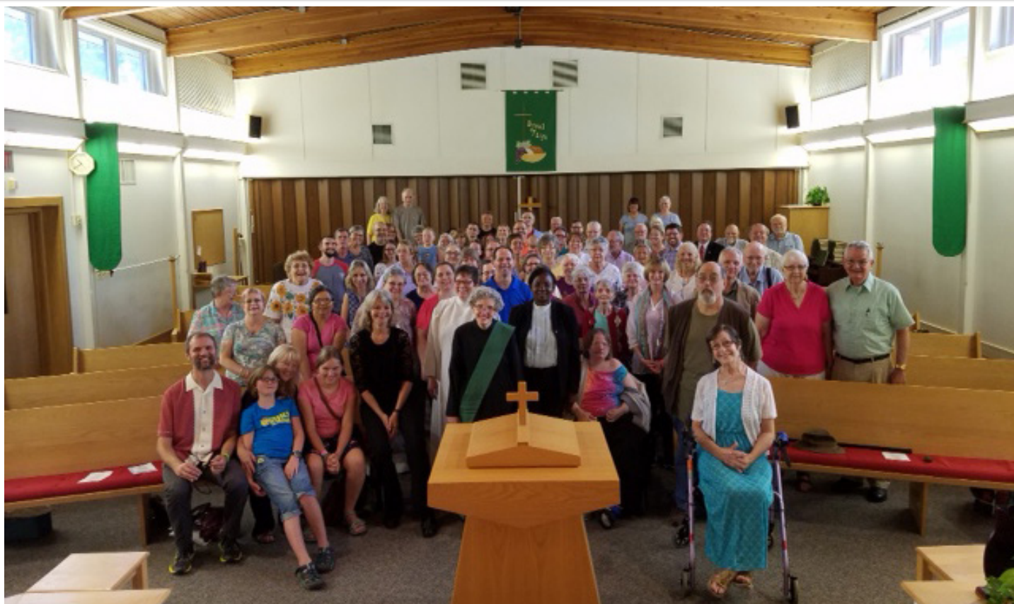
Group picture of worship at Bread of Life Deaf church on the last day of the conference.