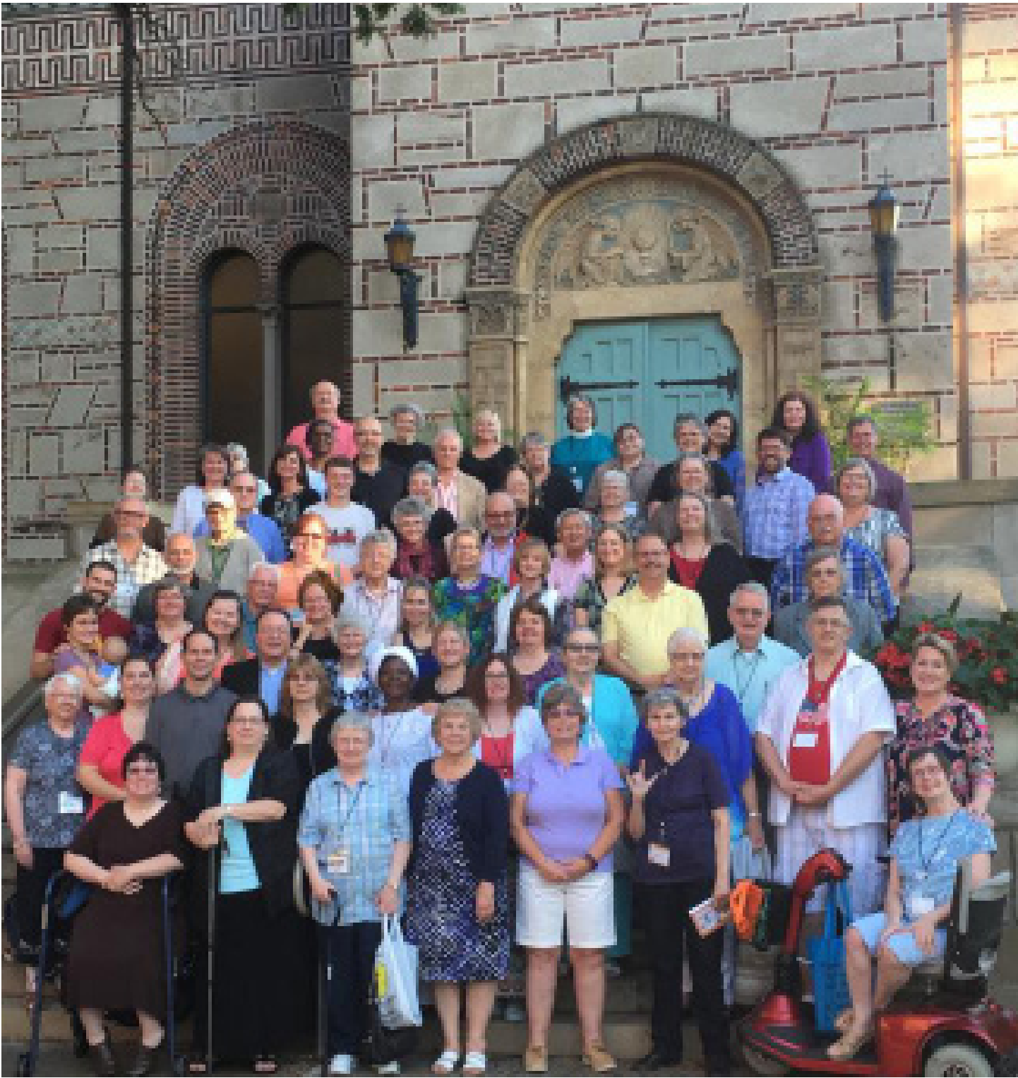
Group picture of the ELDA/ELM Conference in St. Paul MN.