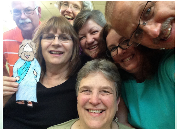
ELDA Members taking their picture with "Flat Jesus"