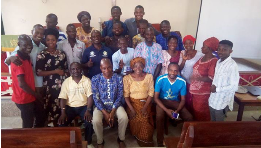
Picture of attendees from the Nigerian Deaf Leader training which was held on August 20-22, 2018 in the Church for the Deaf in Nigeria.