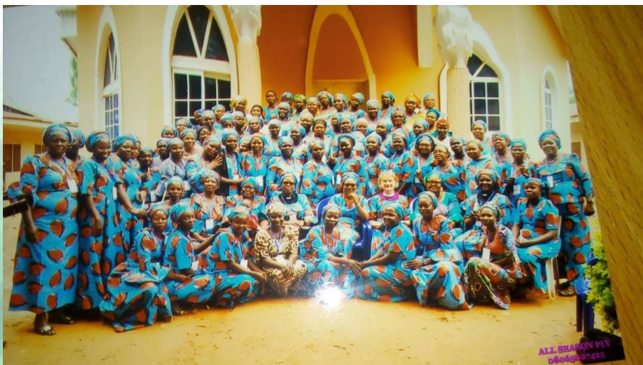
This picture shows the large group of women pastors and theologians who gathered for the conference.

The conference Theme “Getting It All Together” and was for female pastors and theologians. The conference took place on September 6-10, 2018 in Nigeria.